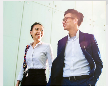
PRU Group Life