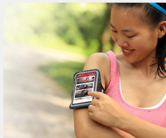
PRU Health in Pulse