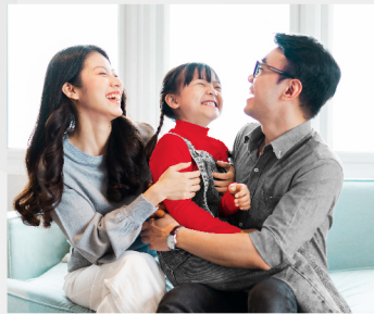
PRU Term Digital