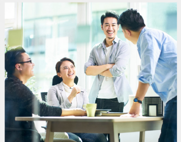
PRU Group Health